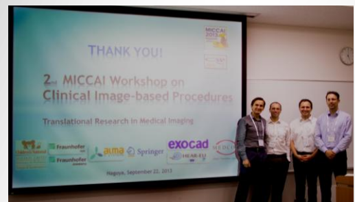
Workshop organizing committee

MedCom has supported the Clinical Image-Based procedures (CLIP) workshop organized by the MICCAI conference on 22 Sep 2013 in Nagoya/Japan and sponsored this year’s Best Paper Award. The CLIP workshop is focusing on translational research on medical imaging and promotes innovative methods which have already proved their clinical applicability and impact, a subject perfectly in-line with MedCom’s strategic orientation. The workshop was a great success again and we are looking forward to learn from its outstanding contributions also in 2014.