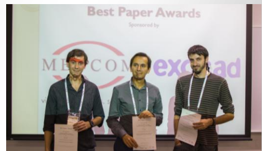
Award winners 2013

We congratulate all winners for their award-winning research (refer to http://miccai-clip.org/2013/program.html for detailed list)